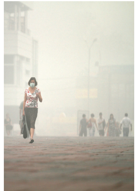
Mexico City's air is much less polluted than it was, but more can be done to improve it.

We have studied the effects of a substantial reduction in emissions of CO 2 unilaterally in Mexico as well as globally on some aspects of air quality in Mexico and North America. We chose Mexico for the study because the metropolitan area of Mexico City is an air pollution hot spot. The megacity is surrounded by mountains, so that bad air can accumulate. It is home to some 20 million people, and it is the centre of economic activity in Mexico. The pollution has long been a problem, and the government has resorted to various costly measures to reduce emissions, including moving polluting factories out of the area, regulating traffic and production when the air quality gets particularly bad, and constructing an urban transport system to help reduce congestion and pollution.